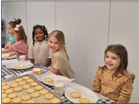
Girls Scouts decorating cookies for Ladle of Love Thanksgiving Feast.

Crown Point Rotary joined us for packing for MacArthur's students. Thank you, everyone!!