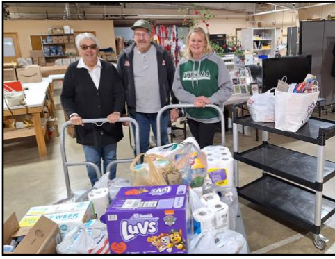
October 13 th In-Pact held their Truth and Treats at the Burrell location.