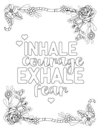
We've made a few changes to the inspirational cards. Now the kids have something to color. And, we put important information for parents on the back side

You can see our many volunteer opportunities via our website. https://www.communityhelpnet.org/how-to-help/