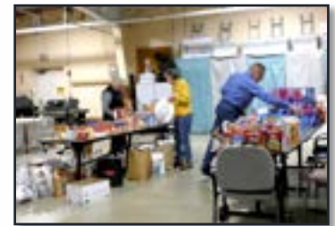
Volunteers sorting Oak Hill Elementary Food Drive Donations