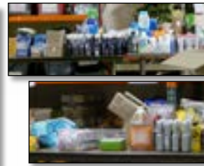
Household Items & Gifts!

Saturday, November 26 th this motley crew went to the Amazon site in Matteson, IL and picked up 5 pallets worth of amazing donations. Thank you, Amazon, for helping us help others!!